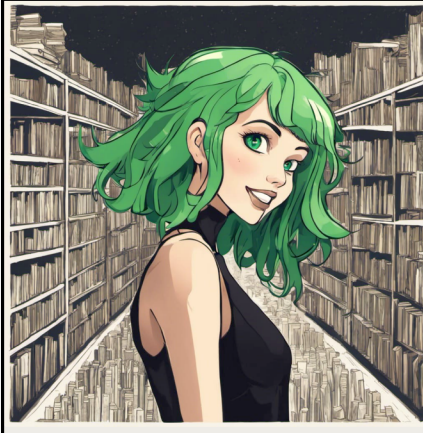
Emmy the Librarian

[EMMY THE LIBRARIAN & THE UNDERGROUNDERS] (COLLECTED EDITION V.5) EMMY IS CONSIDERED A CLASS 1 MUTANT, AND AS SUCH IS STILL ALLOWED TO BE A CITIZEN OF THE EMPIRE. AND WHILE SHE FACES SOME DEGREE OF PREJUDICE, IT PALES IN COMPARISON TO THE PERSECUTION ONE CLASS AND CLASS II. EMERALD HAS FOUND A WAY OF HAVING HER OWN SPACE ON VEGA II. SHE AND THE RELATIVE FREEDOM OF MOVEMENT IT ALLOWS HER. EMMY HAS BECOME A SUBSTANTIAL FIGURE IN THE UNDERGROUNDERS MOVEMENT THAT IS HELPING MUTANTS TO FLEE FROM THE BRITISH EMPIRE TO BRASIL, AND THEN ON TO VEGA II. IN MANY CASES, BUT SOMEONE WITHIN THE MINISTRY OF KNOWLEDGE IS WORKING AGAINST THE UNDERGROUNDERS. THROUGH EMMY IS ABLE TO RECRUIT THEMSELVES, ALLOWING HER TO UNABLE TO DO ANYTHING AS HE IS EXECUTED.