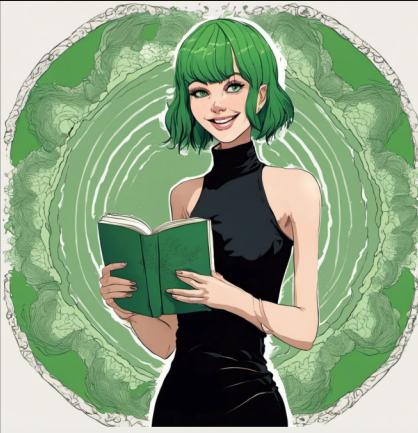
Emmy the Librarian

[EMMY THE LIBRARIAN, CIVITAS BRASIS] (COLLECTED EDITION V.3) THE STORY OPENS WITH EMMY UNDERGOING A WHOLE SLEW OF MEDICAL TESTS. FINALLY SHE SITS IN THE DOCTOR'S OFFICE AS HE SITS AT HIS DESK LOOKING AT THE RESULTS. HE PUTS DOWN THE FOLDER AND SAYS, "EMMY, IF I DIDN'T KNOW FOR A FACT THAT YOU ARE TWENTY-SEVEN, I WOULD SAY THAT YOU ARE EIGHTEEN, NINETEEN, TOPS". SHE THANKS THE DOCTOR FOR CONFIRMING HER SUSPICIONS. FOR SEVERAL HOURS, SHE AND THE DOCTOR CONSIDER THE POSSIBILITY OF HER BEING A MUTANT, BUT MOST MEMBERS OF THE PUBLIC CONSIDERED IT AN URBAN MYTH DESIGNED TO STIR UP ANTI-MUTANT SENTIMENT. WHILE PONDERING WHAT TO DO WITH THE NEWS, EMMY IS CONTACTED BY THE MINISTER. IT SEEMS THAT FOR SEVERAL YEARS, WITH FULL GOVERNMENT KNOWLEDGE, MUTANTS HAVE BEEN BUILDING A CITY, ONE THAT IS COMPLETELY SELF-SUFFICIENT AND PROTECTED BY A WALL. THE CITY, THEY WANT TO TRANSFER EMMY TO THE MINISTRY OFFICE IN THE MAIN LIBRARY THERE. SHE ACCEPTS THE ASSIGNMENT, FEARING THAT A SEPARATE COMMUNITY WILL BECOME A BREEDING GROUND FOR THE MERES TO REBUILD. WHILE SHE DOES ROOT OUT A MERF CELL, THE REAL THREAT TURNS OUT TO BE GOOD OLD FASHIONED GREED AND THIRST FOR POWER AS BOTH HUMANS AND MUTANTS HAVE BEEN TRYING TO CONTROL THE CITY. EMMY MANAGES TO BRING DOWN SEVERAL ORGANIZATIONS, INCLUDING ONE THAT HAD INFILTRATED THE MINISTRY OF KNOWLEDGE.