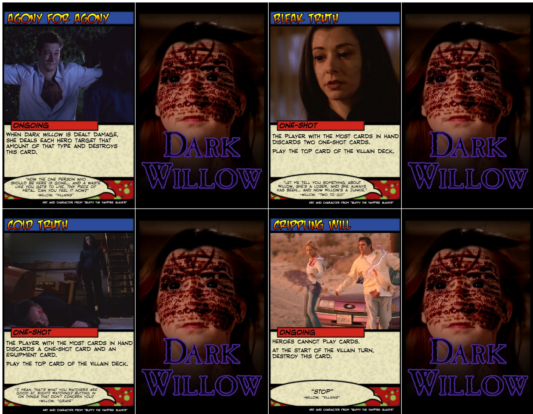
Sentinels of the Multiverse – Buffyverse – Villain Deck: Dark Willow